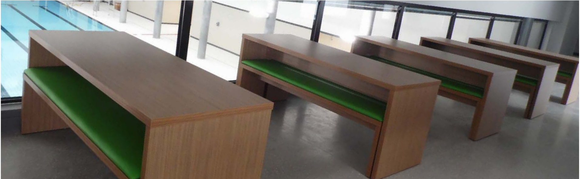
Kingston Seating: Laminated table & bench set with upholstered seat pads

Available in three standard widths: 700mm / 1200mm / 1600mm.