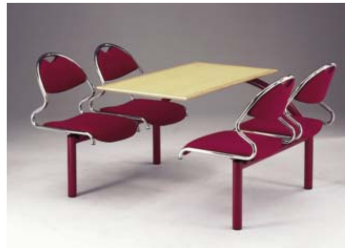
Zurich Multisystem 2000

Seat & Back: Perforated mesh, polished chrome surround Underframe: Black, silver or coloured EPC.