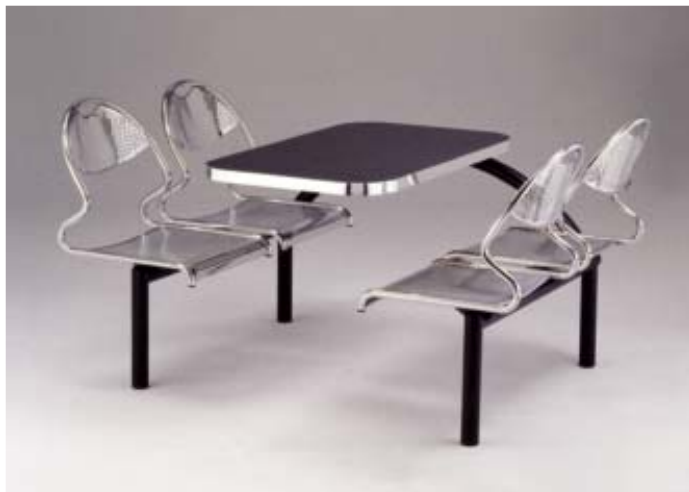
Zurich Multisystem 2000

Moulded Shell. Faced veneer, polished to choice.