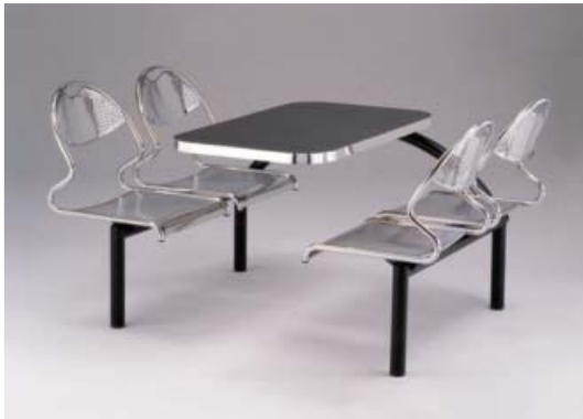
Zurich Multisystem 2000

THE ORIGINAL FAST FOOD UNIT designed by Primo Furniture has offered excellent value and durability for over 30 years. The Multisystem 2000 range has been designed to reflect the increased aesthetic demand towards fixed unit seating. The underframe is constructed from round tubular steel and features a curved table support. Rectangular and circular units complement each other to give maximum versatility within any given space. Wider top versions are also available, ideal for staff catering facilities using tray service.