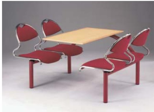
Zurich Multisystem 2000

Seat & Back: Perforated mesh, polished chrome surround Underframe: Black, silver or coloured EPC.